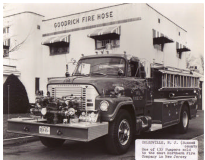
COLESVILLE, N. J. (Sussex county) One of (3) Pumpers sold to the most Northern Fire Company in New Jersey