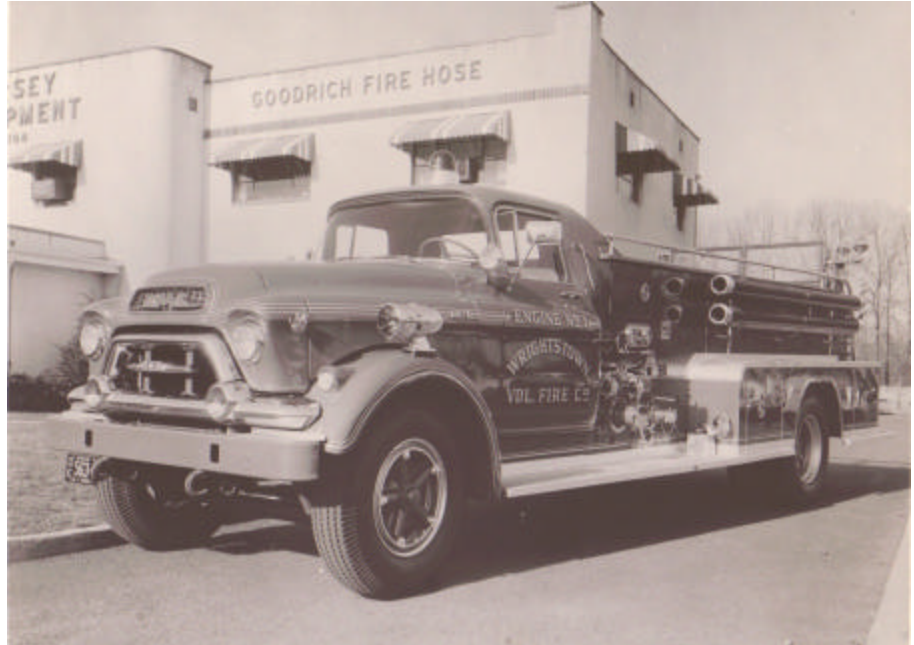
A classic GMC provides the ride for this Great Eastern delivery to Wrightstown! A custom chassis with open cab went South to Cape May (below left) and a handsome rig on an International chassis went North to Colesville (below right).