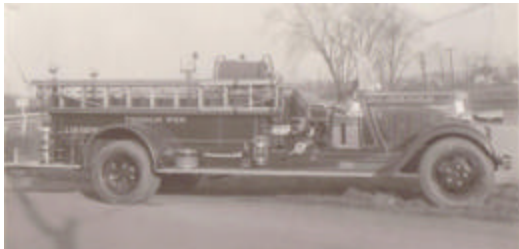
A 1936 Dodge Pirsch sold to New Market Vol Fire Company. More about these sleek little rigs in the next issue!

New Jersey Fire Museum & Fallen Firefighter's Memorial 175 Washington Street Long Branch NJ 07740