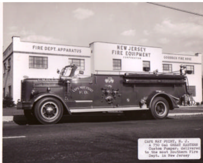
CAPE MAY POINT, N. J. A 750 Gal GREAT EASTERN Custom Pumper, delivered to the most Southern Fire Dept. in New Jersey

Next Time: The tale of two New Jersey Stutz fire apparatus and their hundreds of recent off-springs!