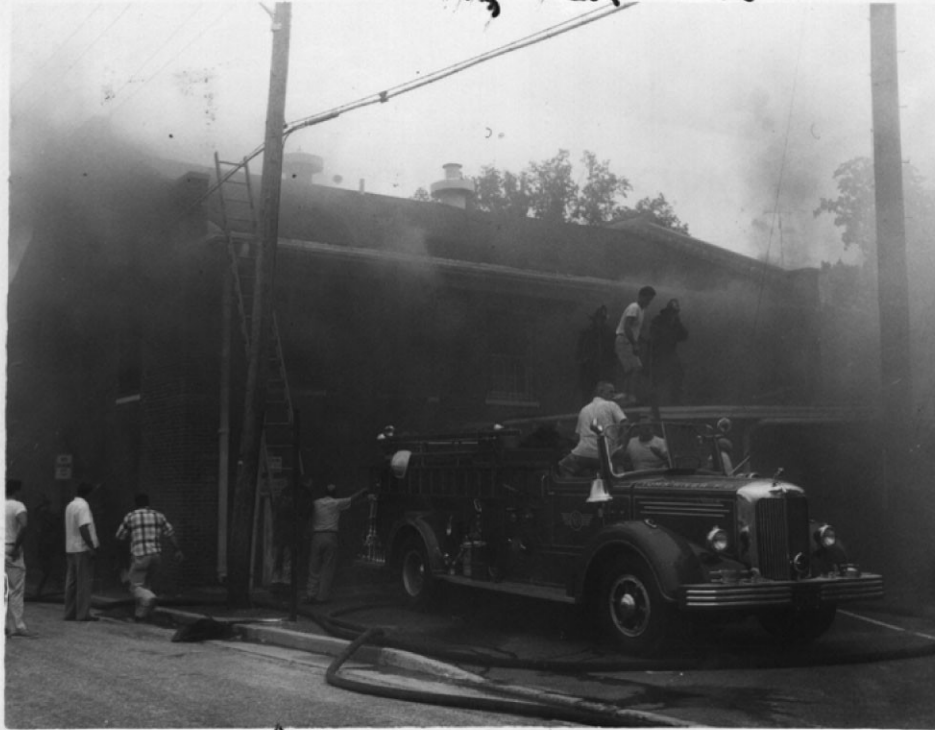
Aug. 23, 1959.