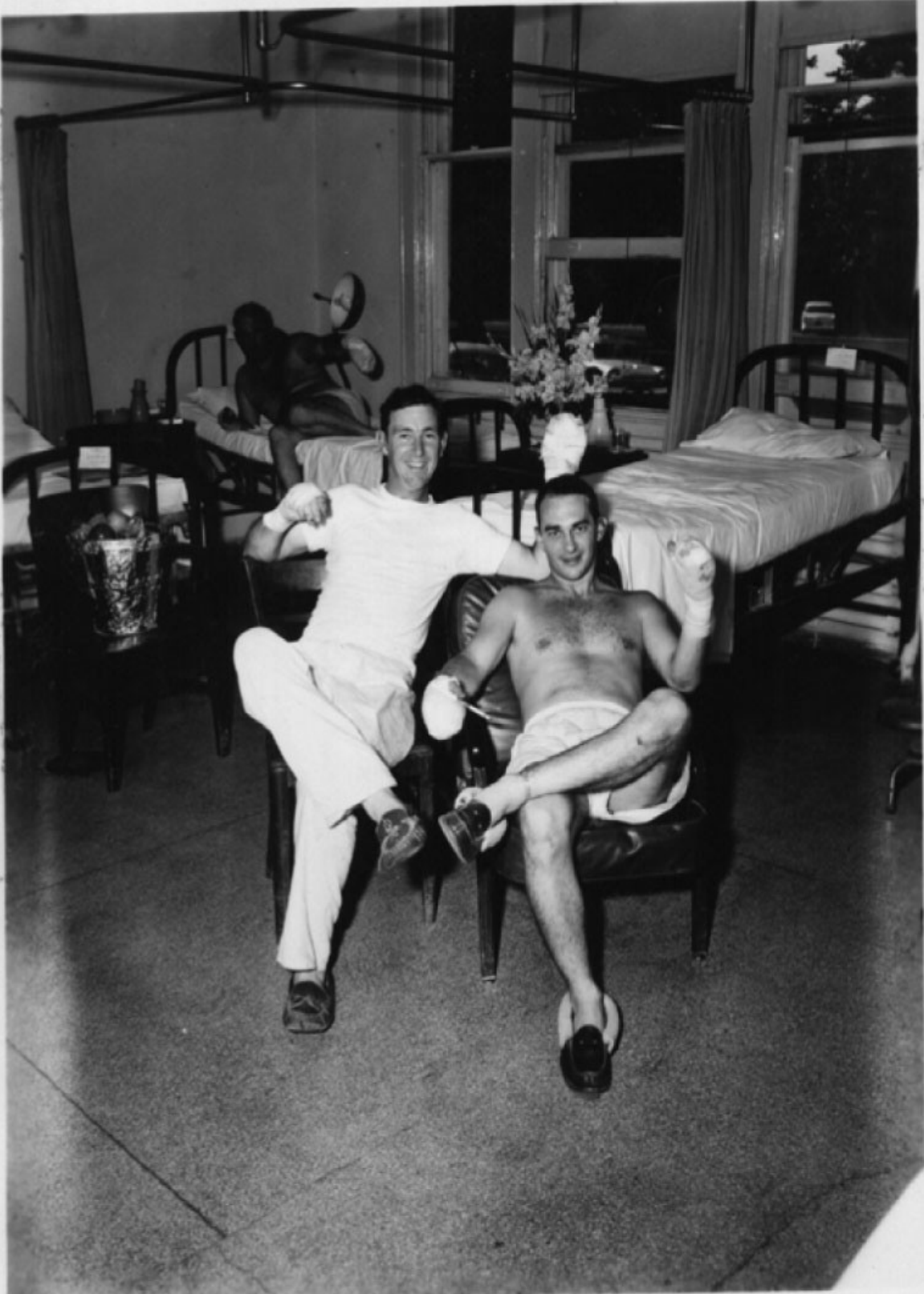
Jail Five Aug '89