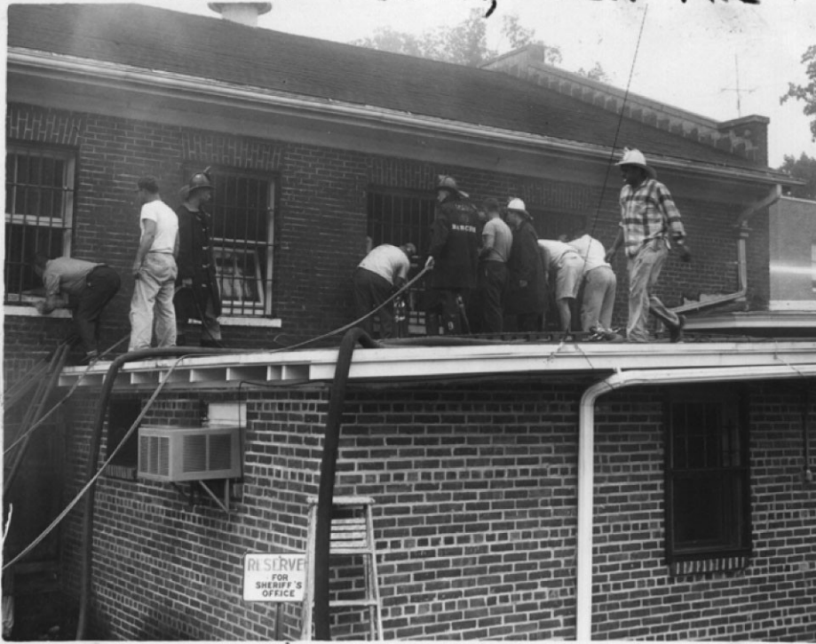
Aug. 23, 1959