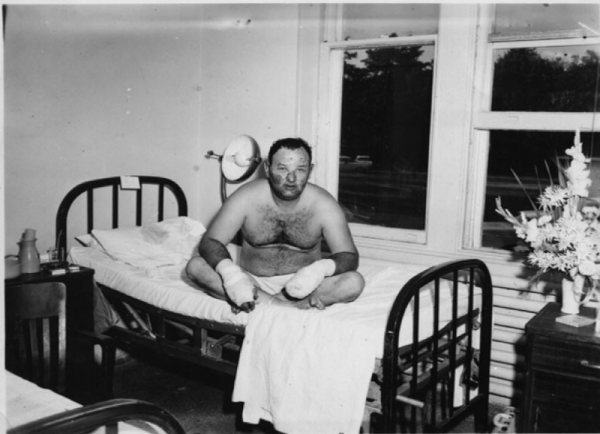
Jail Five - Aug. '59